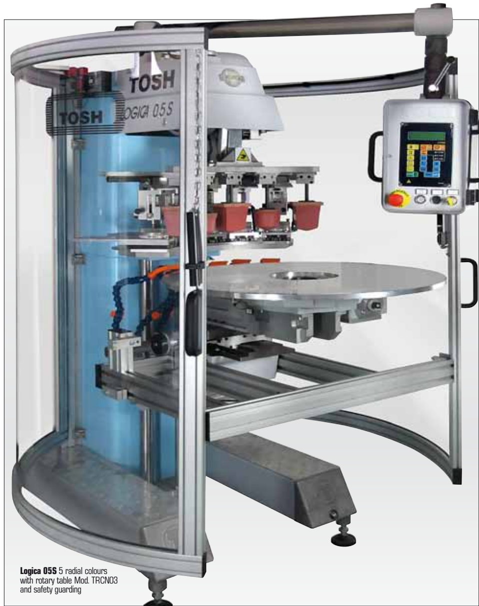
Logica 05S 5 radial colours with rotary table Mod. TRCN03 and safety guarding